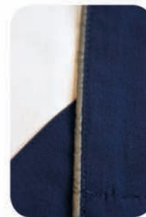
Navy White Reflective