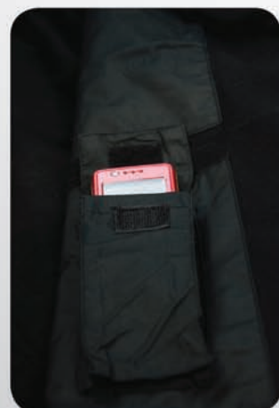
Inside Mobile Phone Pocket